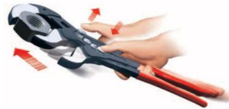
Fast and firm adjustment directly on the work piece

The Cobra® XXL comes along with the weight of a 2" pipe wrench but offers a back-up gripping capacity up to 4 1/2"