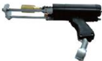
Stud Welding Gun - JD 25 I