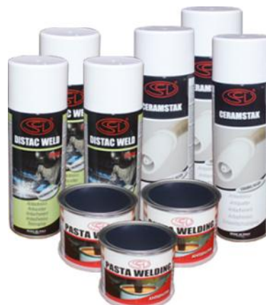
Recommended Anti Spatter for better Welding result