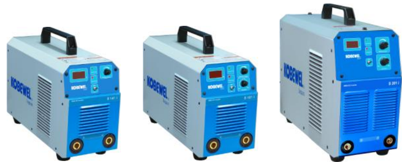
S 141 i