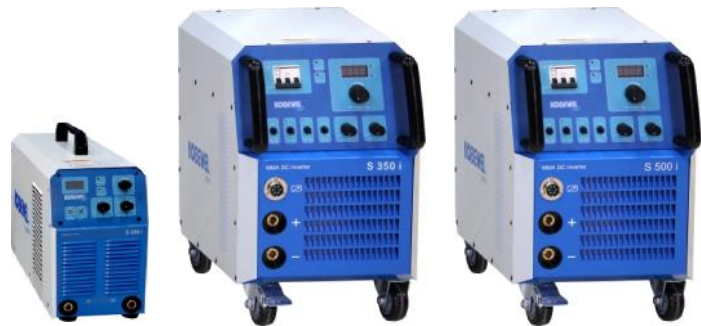
S 250 i