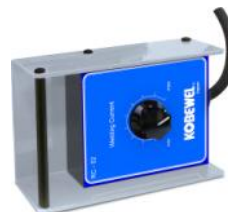
Remote Control RC-02