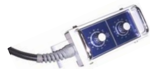
Remote Control for KA