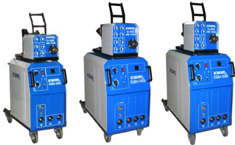
KMD 285 & D 285