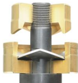
Puncher Cutting Diagram