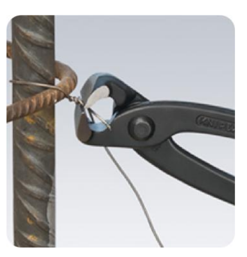
Quick and comfortable twisting and cutting of binding wire