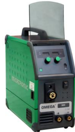
Omega 2 300