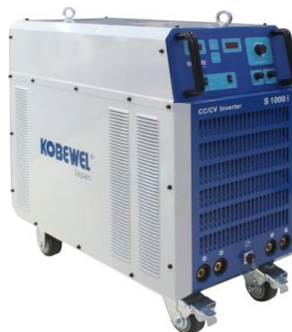
S 1000 i - CC/CV