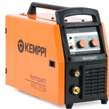
Kempact Mig 2530