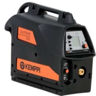
Arcfeed 300 RC