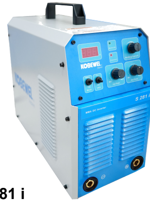
S 281 i